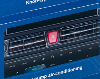
Heat pump air-conditioning