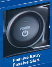
Passive Entry Passive Start