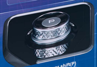
Knob-type Lever shift(P)