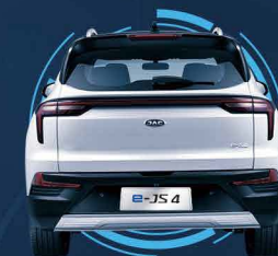
Through-type rear taillights