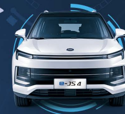
Geometric shape front face