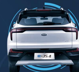
Through-type rear taillights