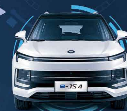
Geometric shape front face